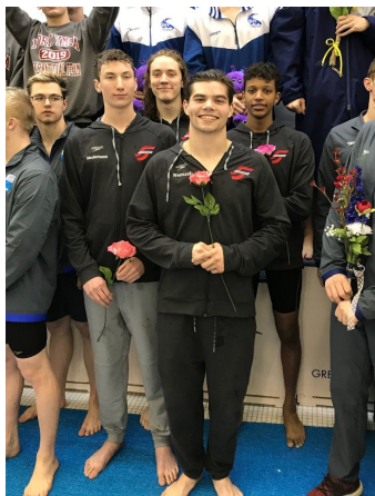
Team Relay Success at Nat YMCA