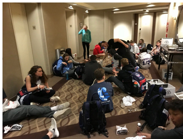
Nat YMCA Dinner in Quiet Room